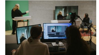
Fig. 1: Broadcasting studio of the institute.

In the summer of 2020, the Project Fund for Teaching of the Vice Rectorate for Academic Affairs enabled the institute to set up a broadcasting studio, which is used in teaching in various formats, for example by recording the lecture "Construction" (Flipped Classroom concept) and live streaming of inputs in the two seminars "Form and Design" and "Construction". After each session, a URL to feedbackr is displayed, where the students can ask questions. These are then answered live from the studio by the lecturers.